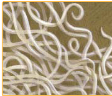
Adult and advanced stage roundworms, illustrated at magnification

Roundworms enter the body when ingested as eggs that soon hatch into larvae. These larvae travel through the liver, lungs, and other organs. In most cases, these “wandering worms” cause no symptoms or apparent damage. However, in some cases they produce a condition known as visceral larva migrans . The larvae may cause damage to tissue and sometimes affect the nerves or even lodge in the eye. In some cases, they may cause permanent nerve or eye damage, even blindness.