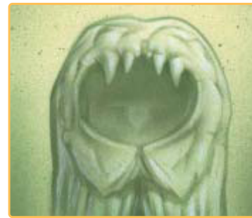
Mouth of hookworm larvae, magnified greatly.

Hookworm larvae typically move about within the skin, causing inflammation in the affected skin. This is called cutaneous (skin) larva migrans . One type of hookworm can penetrate into deeper tissues and cause more serious damage to the intestine and other organs.