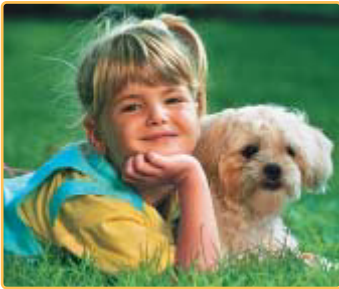
This information was produced through an educational grant from Merial.

The presence of the CDC logo on this brochure is not intended as an endorsement of any commercial entity referenced herein. The mark of the CDC is licensed under authority of the PHS.